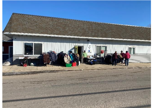
(Pictured above: Volunteers and Customers at the Thrift Store Opening on Saturday, February 27 th )